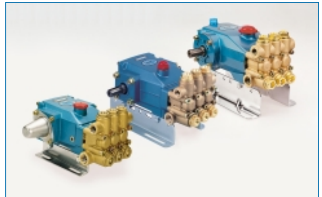
3CP, 5CP, 7CP