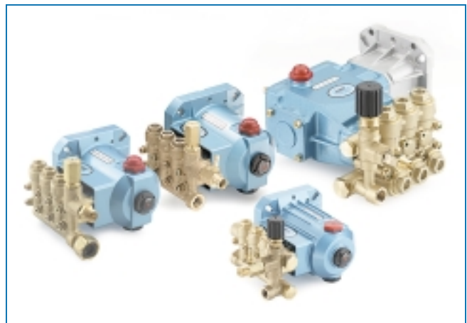
2DX, 3DX, 3SP, 66DX