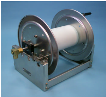
Manual rewind with full frame and pinlock