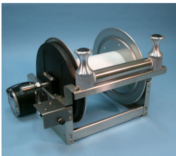
12 volt electric rewind with optional hose guide