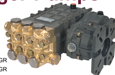
GK 17/35-GR GK 21/35-GR