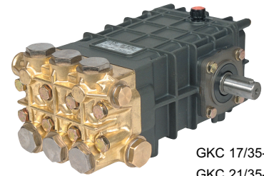
GKC 17/35-S GKC 21/35-S