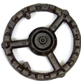
Gas Burner Ring

The Standard for Gas-Fired Pressure Washers. Impinged Jet Burner Rings offer the most efficient utilization of gas for heating water.