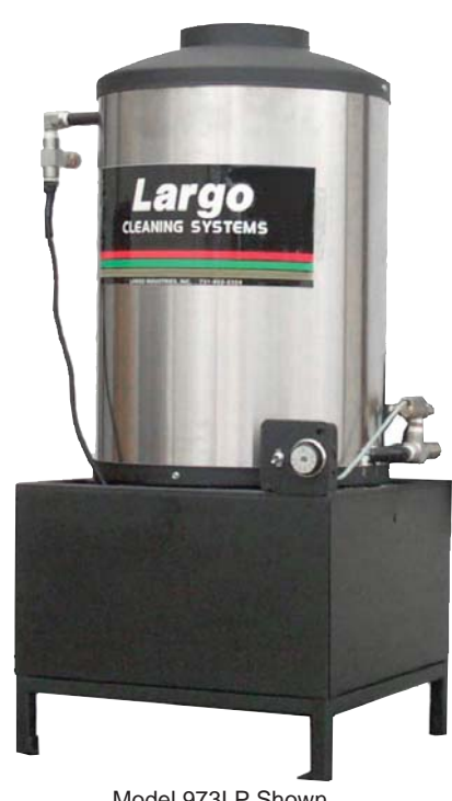
Model 973LP Shown