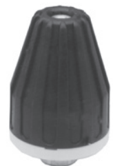
IDK 4600 PSI 180° F

800-544-1188 DIRT KILLER - American distributor of Kränzle