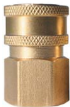
Shown: Brass Female Pipe Thread (FPT)