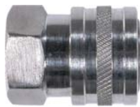
Shown: Stainless Steel Female Pipe Thread (FPT)

Stainless Coupler with 'Safety Loc System'